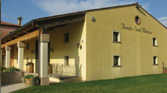
Open barrel fermentation Campo dei Gigli Amarone; the new Tenuta Sant'Antonio winery.