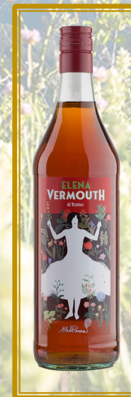
Vermouth di Torino Rosso