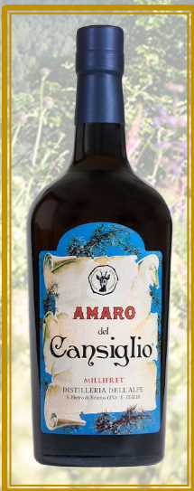
Amaro del Cansiglio