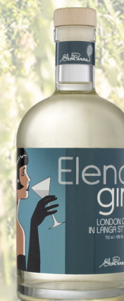
Elena London Dry Gin