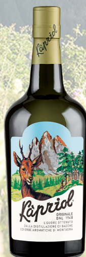
Kapriol Originale dal 1948